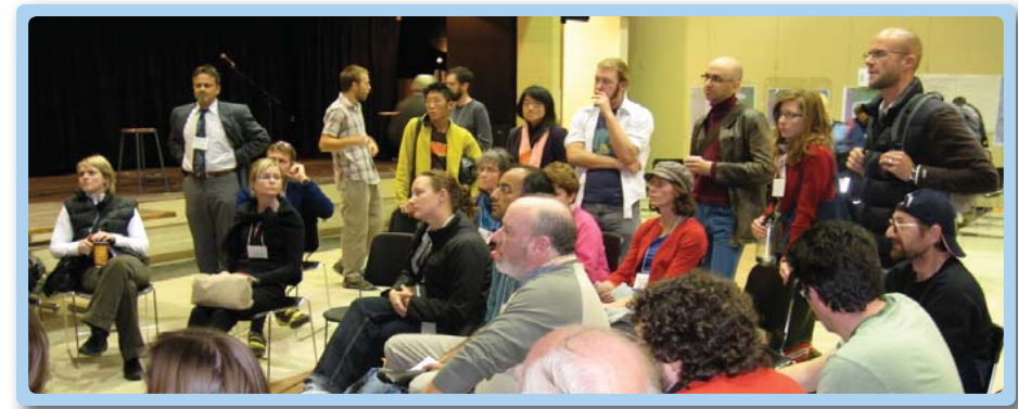
Bike to the Future's 2007 forum report

We have lobbied City Council members with a focus on on-road cycling and on-street infrastructure along with active transportation trail developments. We participate in regular meetings and correspondence with City Planners to clarify our goals and objectives as commuter cyclists. We are using this interactive process to educate ourselves and others and we see the process as a way of building on best-practices from other countries and cities in Canada and around the world. To this end, we have completed a review of City By-Laws as they pertain to cyclists and we have made clear recommendations based on already existing By-Laws in Western Canadian Cities.