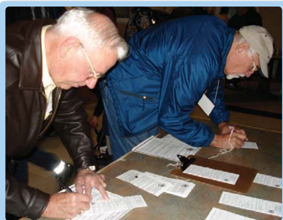
New members of Bike to the Future

The objective of the discussion was to come with a strategy and set of priorities to move the provincial government towards a provincial bicycling policy that help make Bike to the Future's vision a reality in Manitoba. The participants provided ideas and suggestions for Bike to the Future to use in lobbying the provincial government to improve cycling in Manitoba. These suggestions tended to fall into three areas: Benefits of Cycling, Education, and Provincial Policy and Funding.