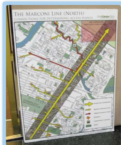
Maps of existing cycling infrastructure like the Northeast Pioneers Greenway were posted

The purpose of this session was to discuss the importance of neighbourhood-by-neighbourhood route identification and to establish the characteristics of useful bicycle maps. It became an attempt to answer this question: What kinds of bicycle maps can be created and what can they be used for? The resulting priorities reflected the group's consensus that maps are best used for two main reasons: developing new ideas and showing what's already there.