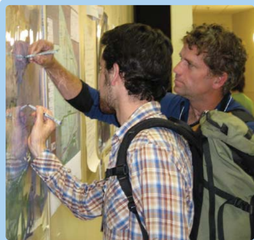
Forum attendees marking a map with the routes on which they ride

It was in this environment that the first Bike to the Future forum was organized, resulting in information sharing and discussions by about 100 participants, and a report with recommendations to city and provincial governments. The momentum generated by this event led to the creation of a new bicycling advocacy organization, Bike to the Future.